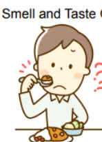
Smell and Taste Gone?