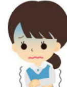
Muscle Aches and Chills?